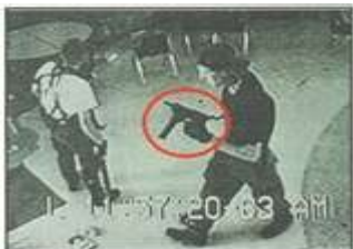
Dylan Klebold & Eric Harris Cold Bloody Murderers