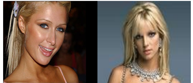
Hollywood Brat Girls Paris Hilton & Britney Spears

Pornography is fake and needs to be viewed like a cartoon says, porn advocate Nina Hartley! If that is true, why is there a 350,000 sex crimes recorded each year.