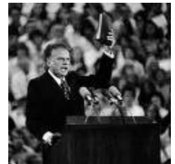
Billy Graham preached a message of hope and I finally understand!

The crime rate is going down in Canada but the social lawlessness is going up. We all recognize there is something wrong in our society, but we just can't grasp the source for our unease. Put aside your doubt and skepticism for a few moments and pretend the Bible contains the answers and solutions to our complex problems. The Bible does not sugar coat the reality of evil or sin and offers a solution.